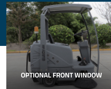
OPTIONAL FRONT WINDOW