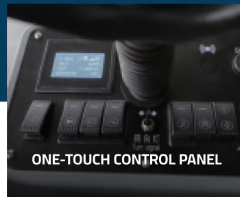
ONE-TOUCH CONTROL PANEL