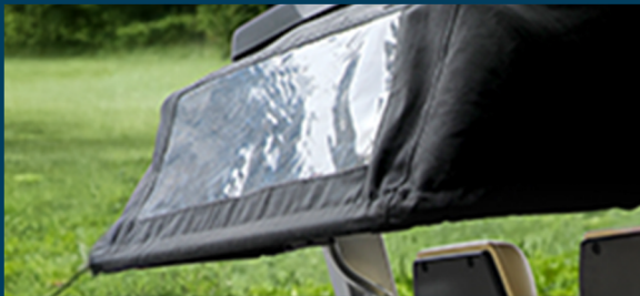
Bag cover with retractable mechanism (option)