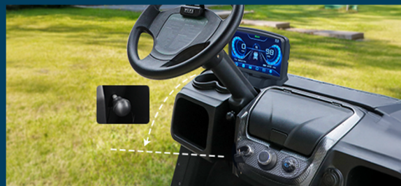
Adjustable steering column