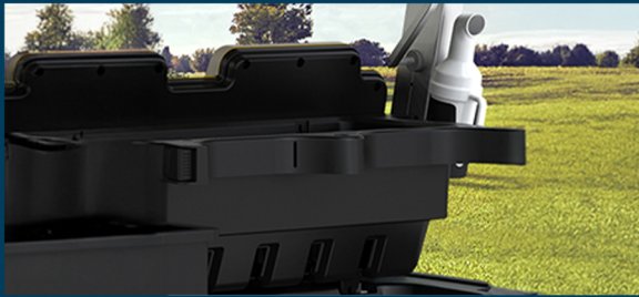
Golf bag holder