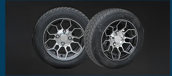
12" Aluminum wheel 205/50R12