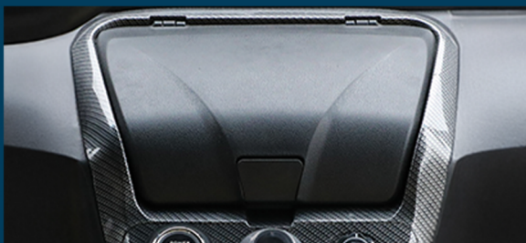
Built-in refrigerator (option)