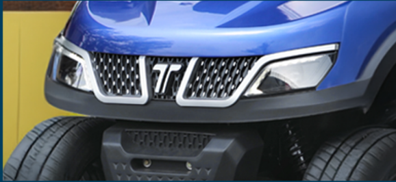
Led brake lights and turning signals