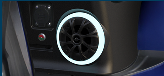
Stereo system with lights