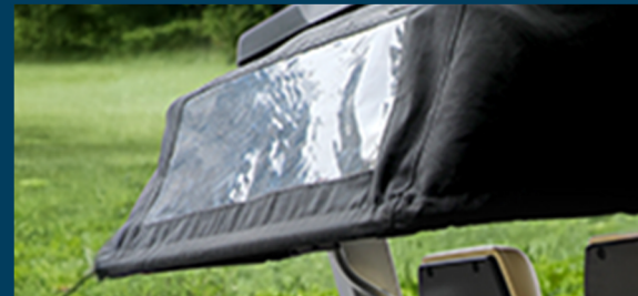
Bag cover with Retractable mechanism