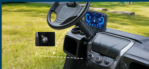
Adjustable steering column