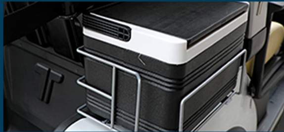
Caddy master cooler