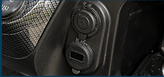
USB charging port