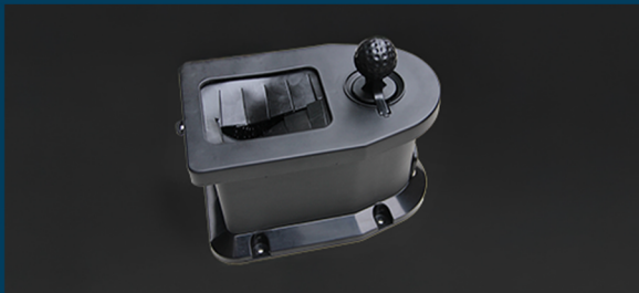
Golf ball washer