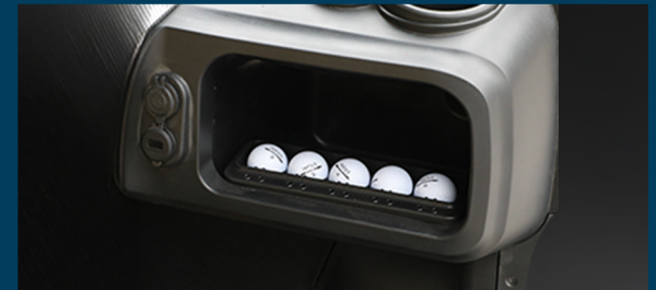
Storage compartment with golf ball & tee holder