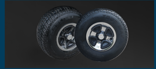
8" iron wheel 18/8.5-8 tire