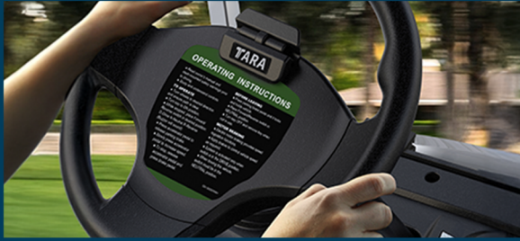
Comfort grip steering wheel with scorecard holder