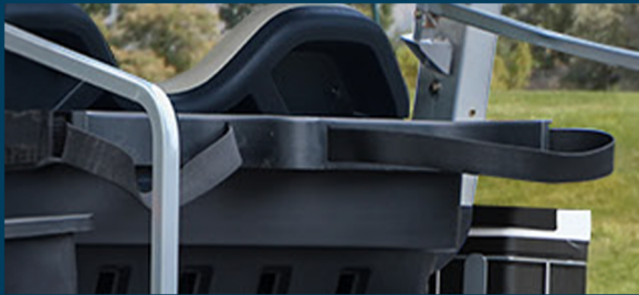
Golf bag holder and Storage compartment