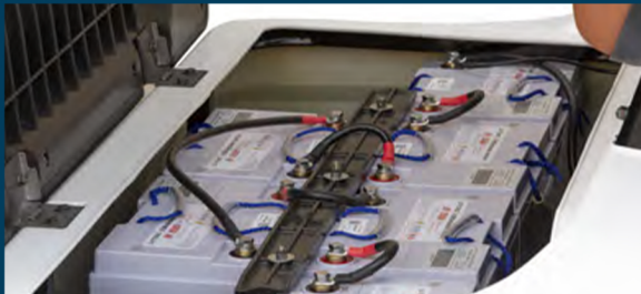
6-8-12 Volt batteries