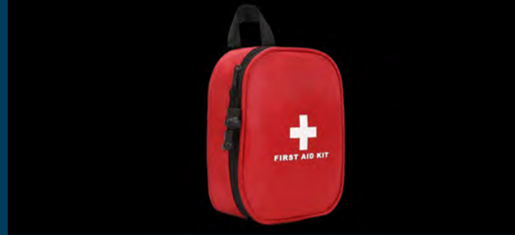
A FIRST AID BAG