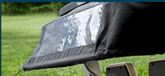
Bag cover with retractable mechanism (option)