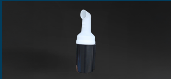
Sand bottle (option)