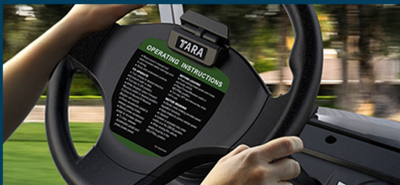
Comfort grip steering wheel with scorecard holder