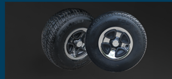
8" iron wheel 18/8.5-8 tire