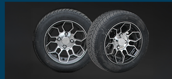
12" Aluminum wheel 205/50R12