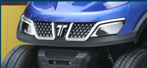
Led brake lights and turning signals