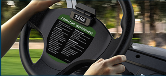
Comfort grip steering wheel with scorecard holder