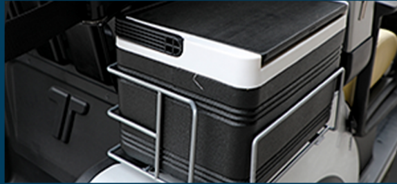
Caddy master cooler